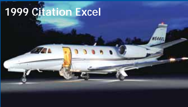
1999 Citation Excel