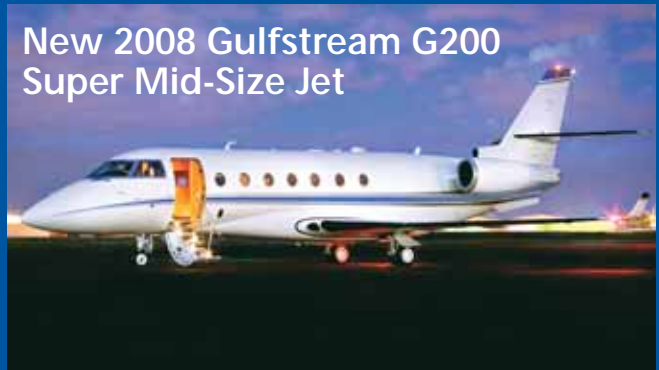
New 2008 Gulfstream G200 Super Mid-Size Jet