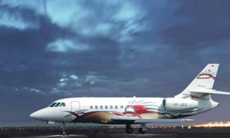
2004 Falcon 2000EX EASy S/N 34