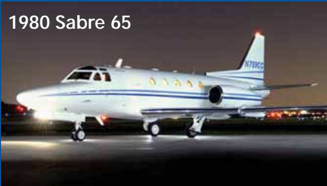
1980 Sabre 65