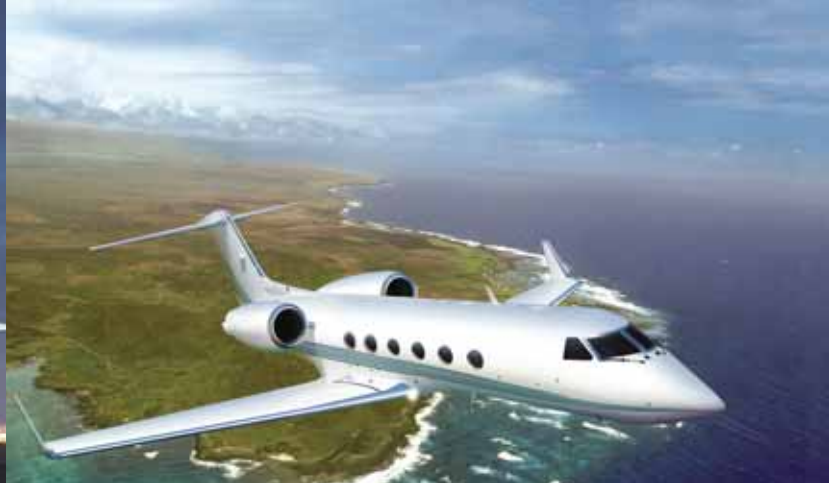
NEW 2009 Gulfstream G450